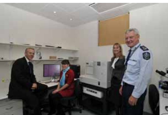
Unveiling of Nanozoomer funded by SA Police Ride Like Crazy