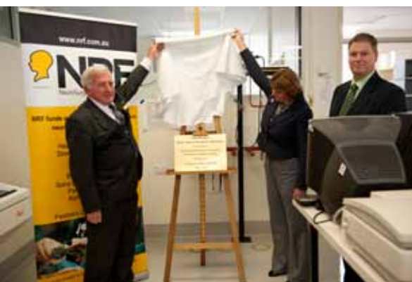
Unveiling of plaque on the Dean Bowman Brain Tumour Research Laboratory